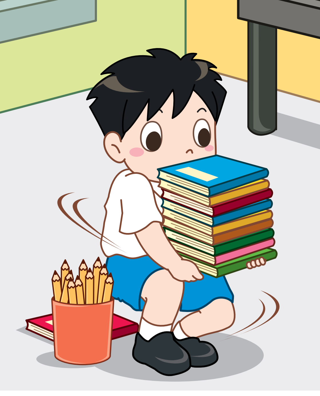
I have nine books.