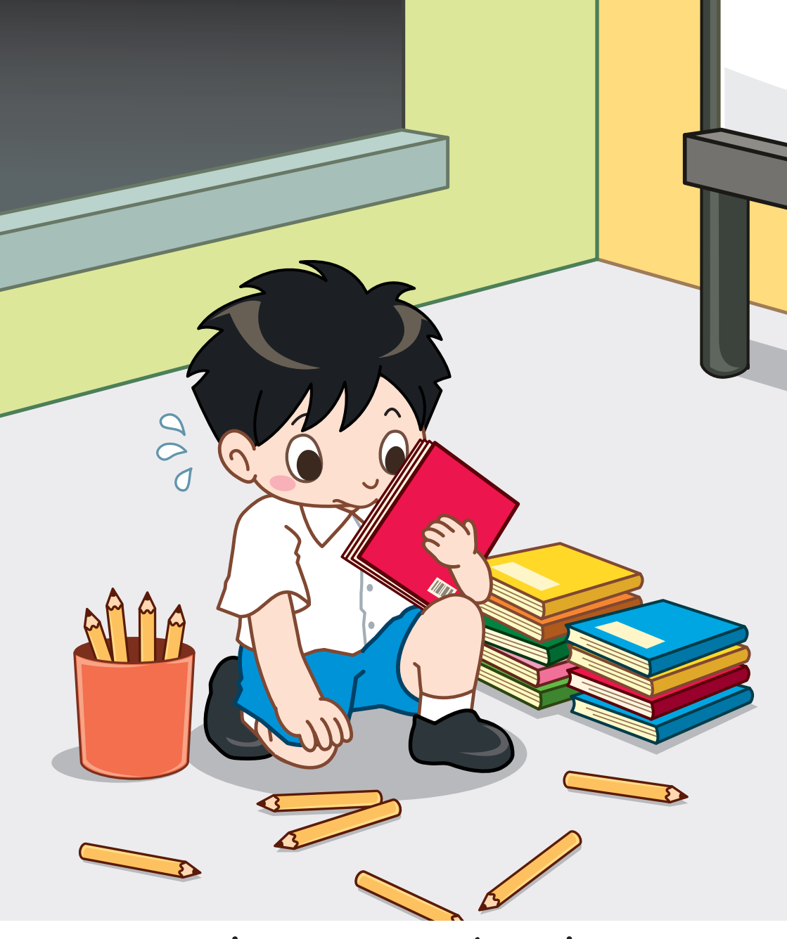
I have one book.