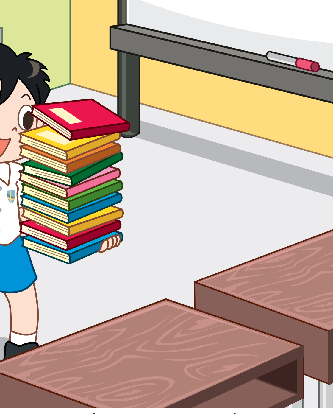
I have ten books.