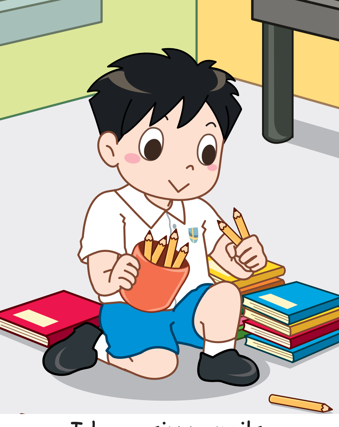
I have six pencils.