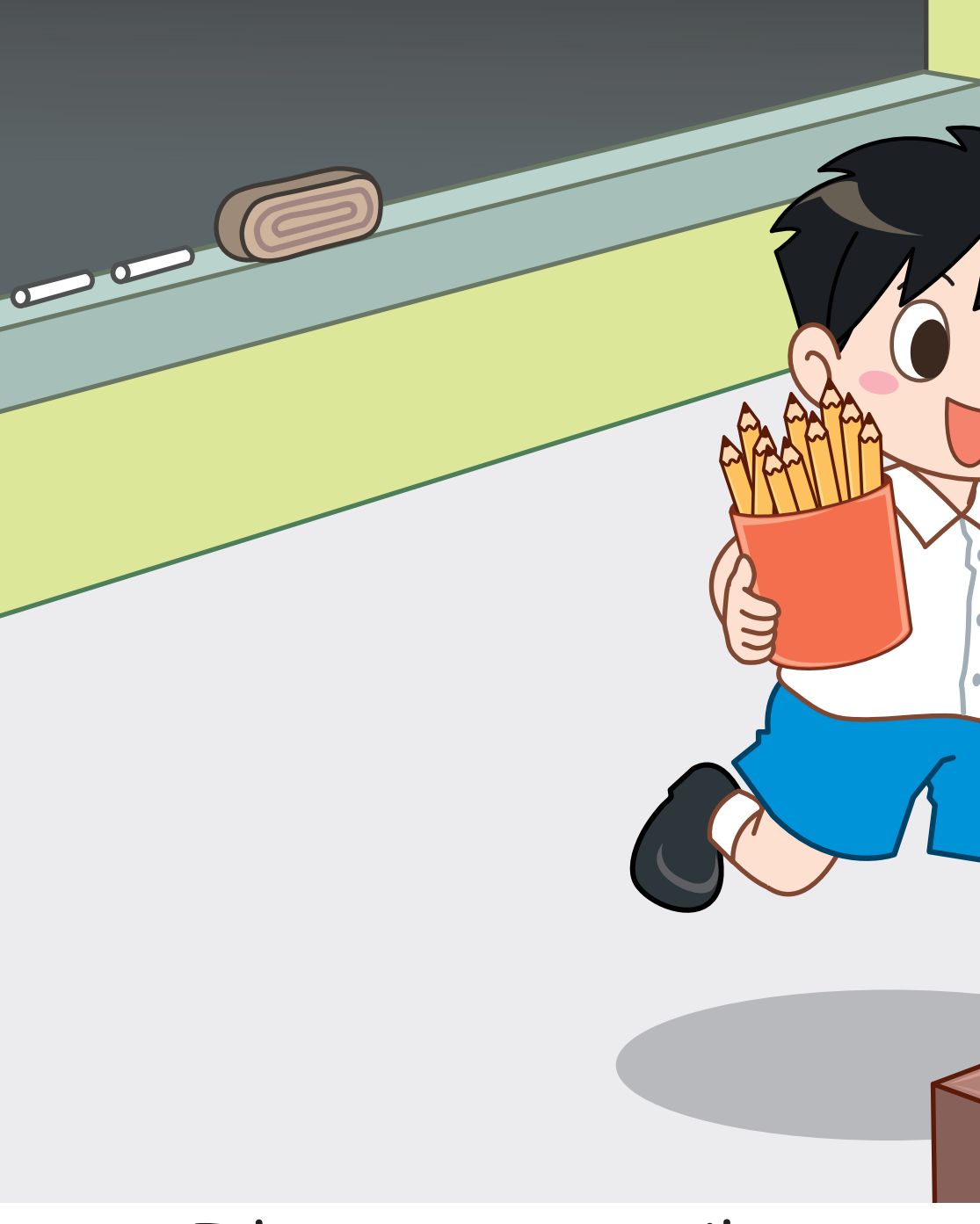
I have ten pencils.