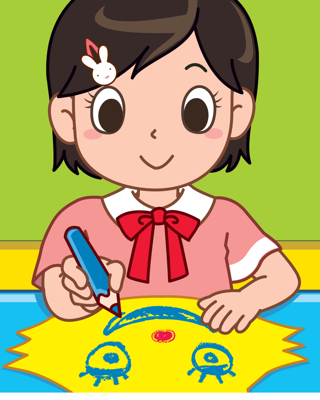
Draw the mouth.