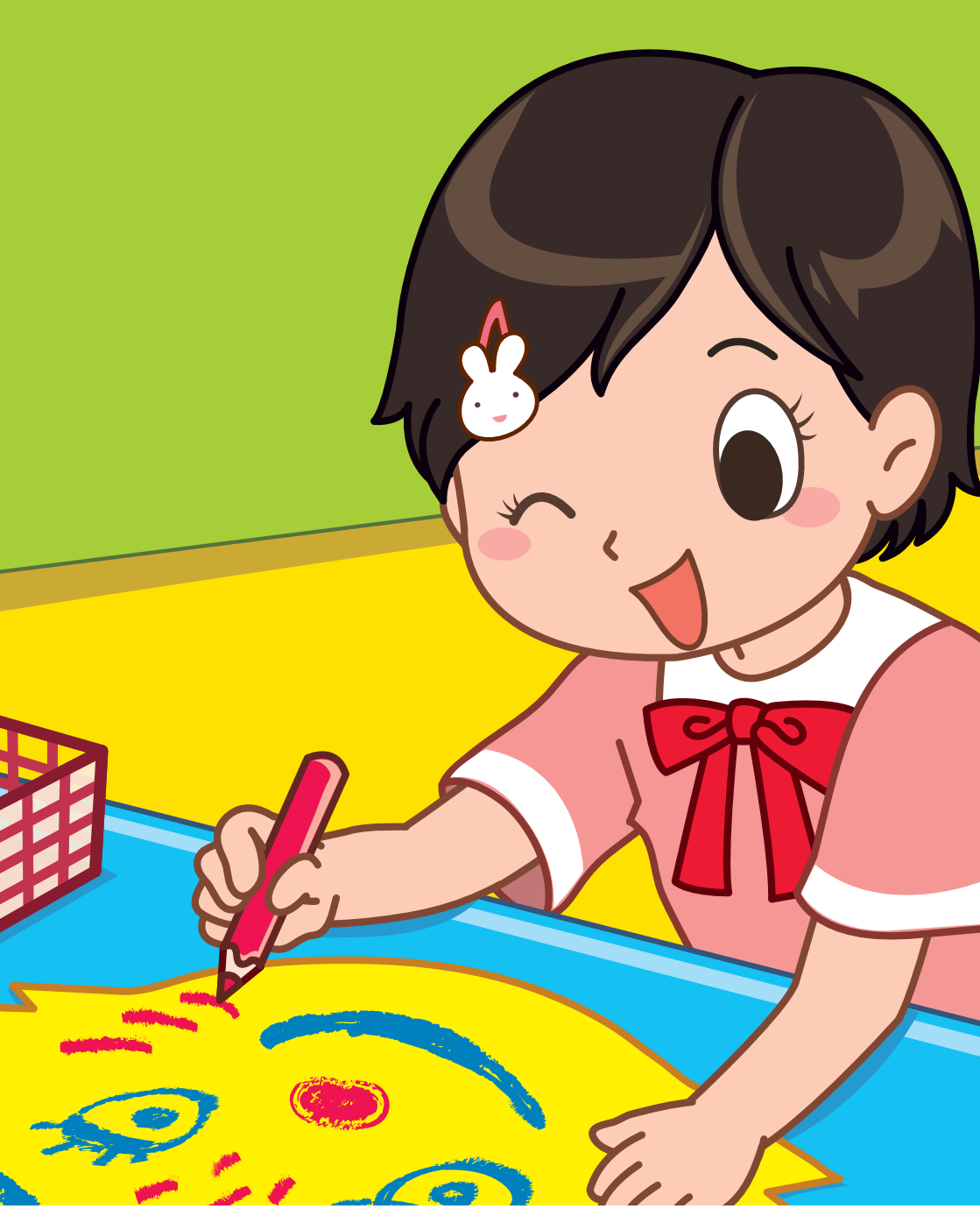
Draw the hair.