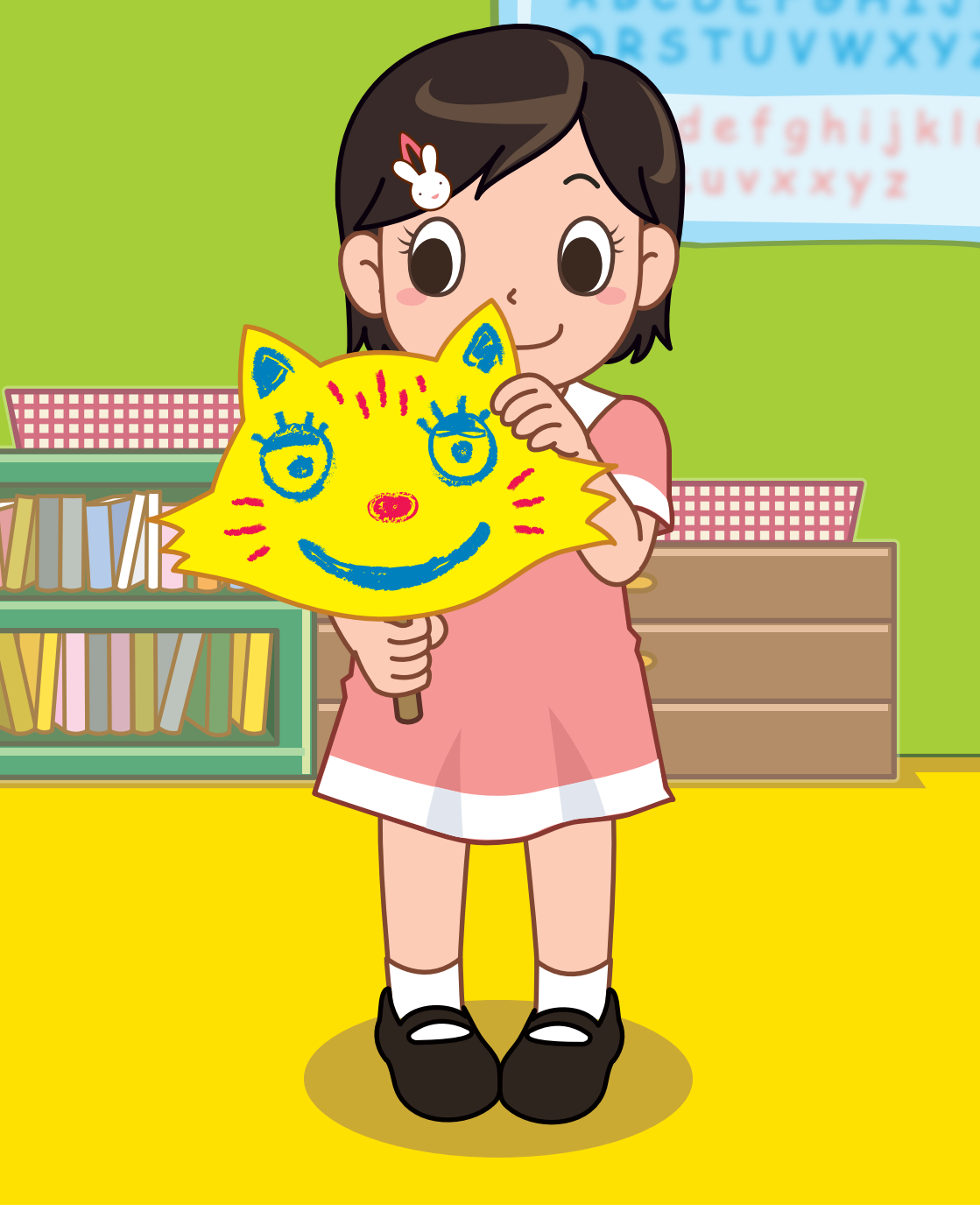
It is a cat.