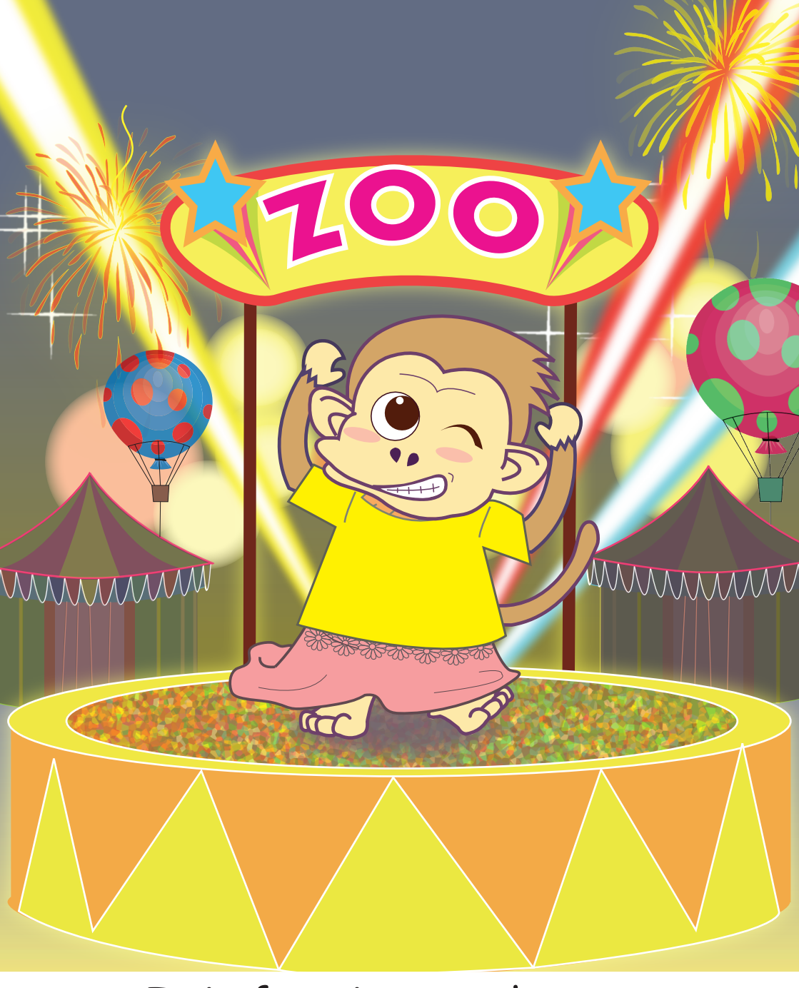
It is fun time at the zoo.