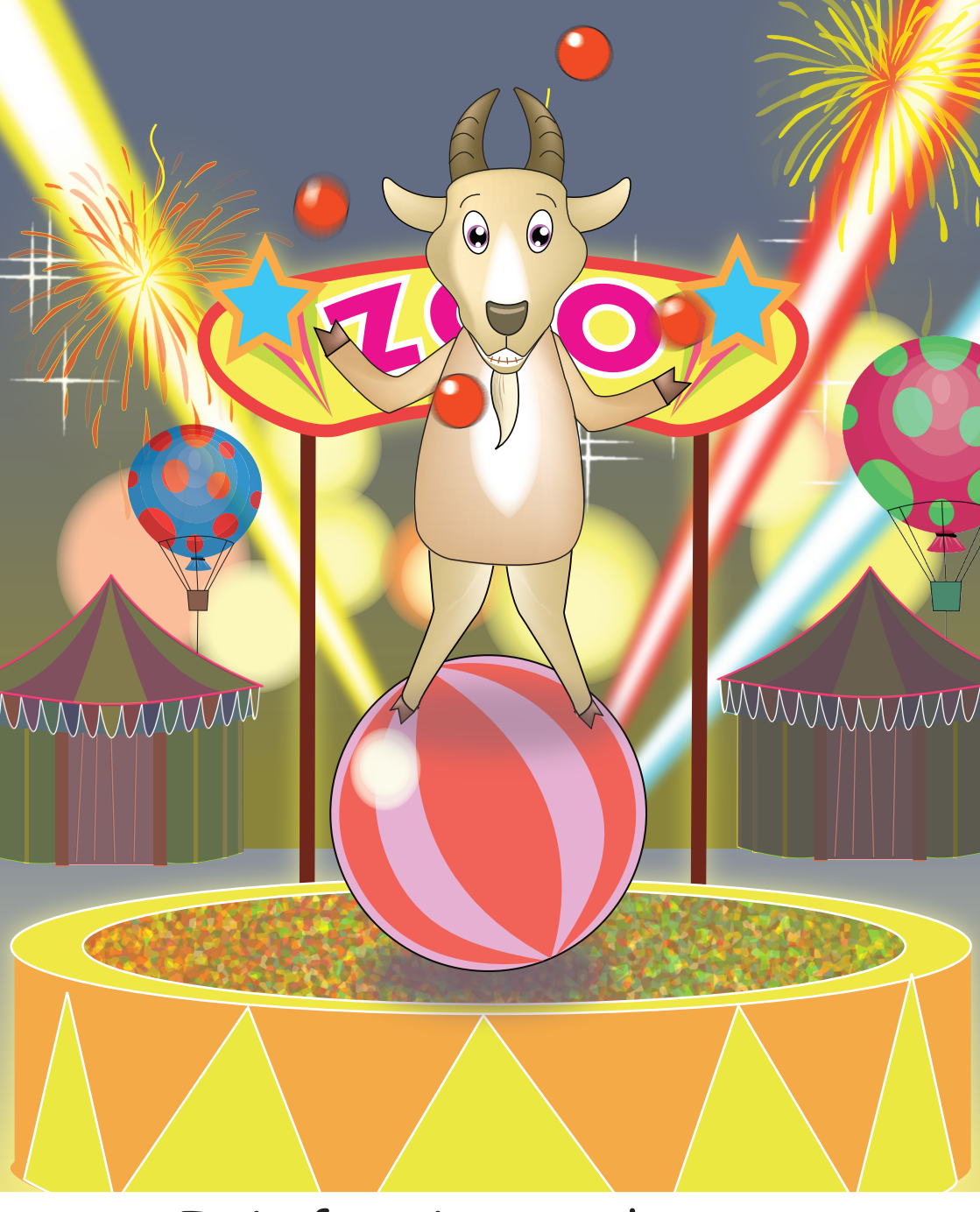
It is fun time at the zoo.