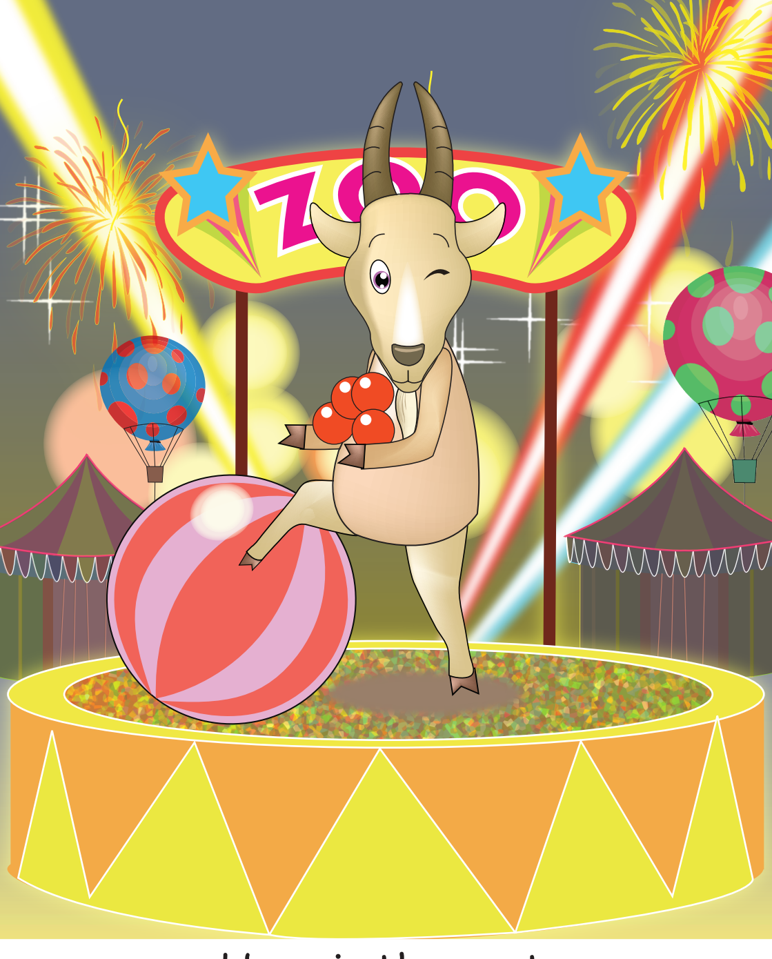
Here is the goat.