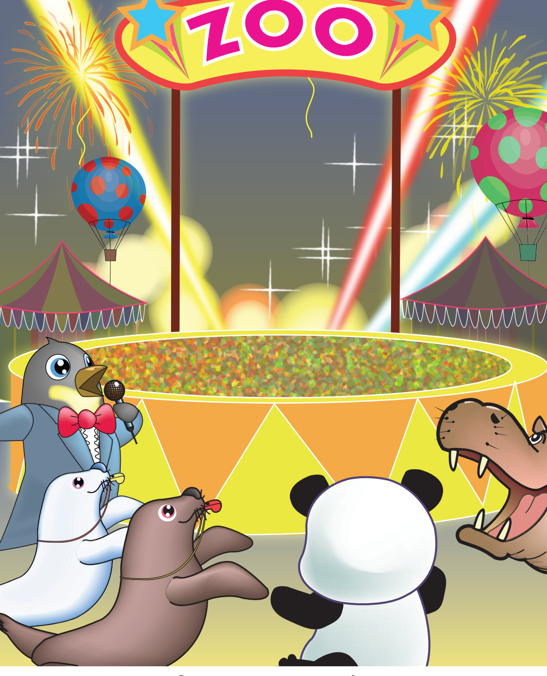
It is fun time at the zoo.