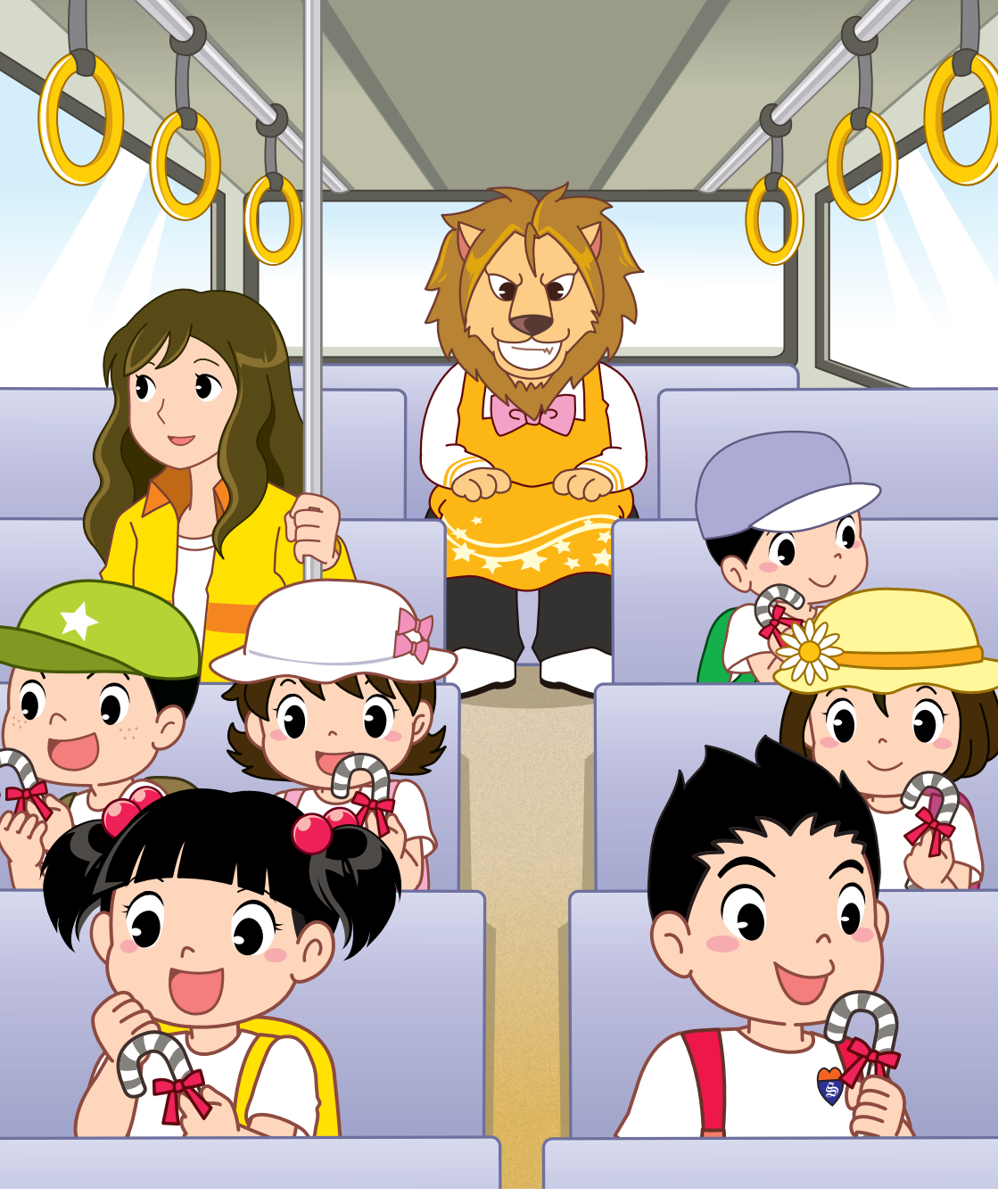
We go home.