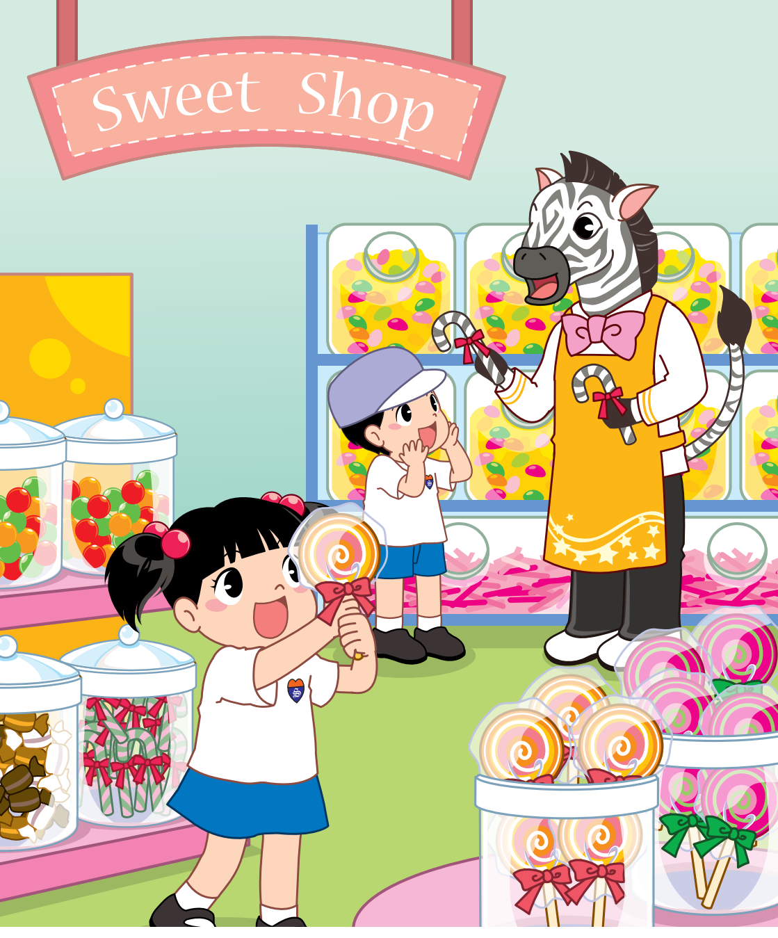
We go to the sweet shop.