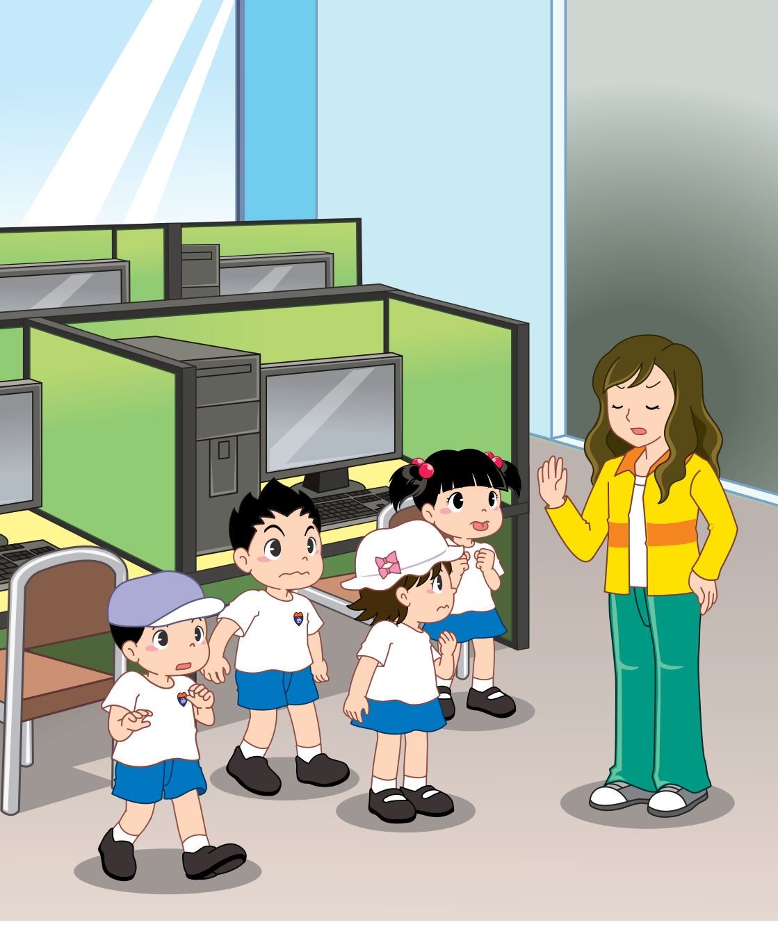
We must not run in the computer room.