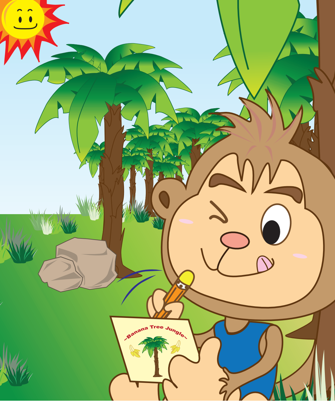
Mat Monkey is writing a postcard to Mip Monkey.