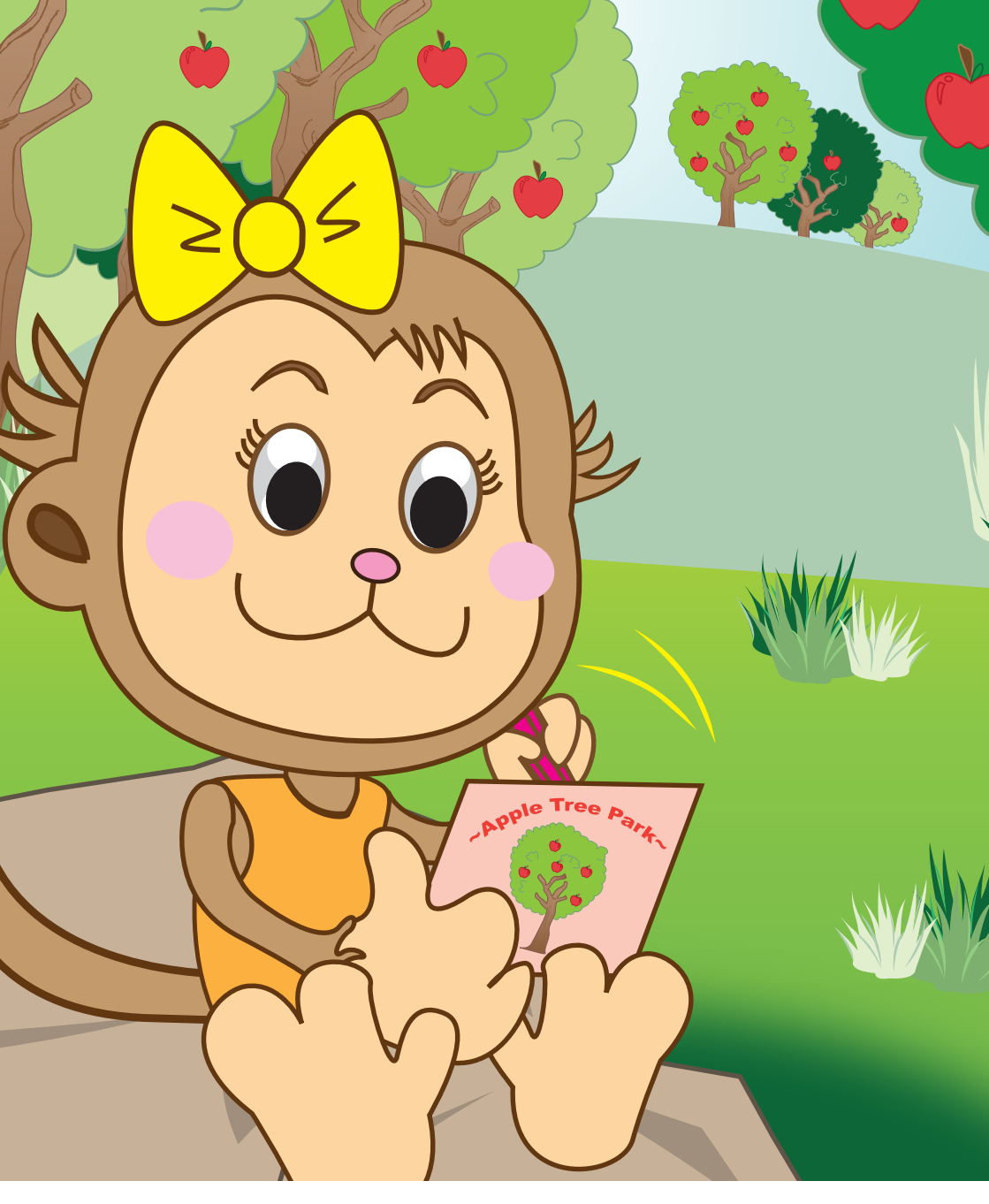
Mip is sitting on a rock. She is writing a postcard to Mat Monkey.