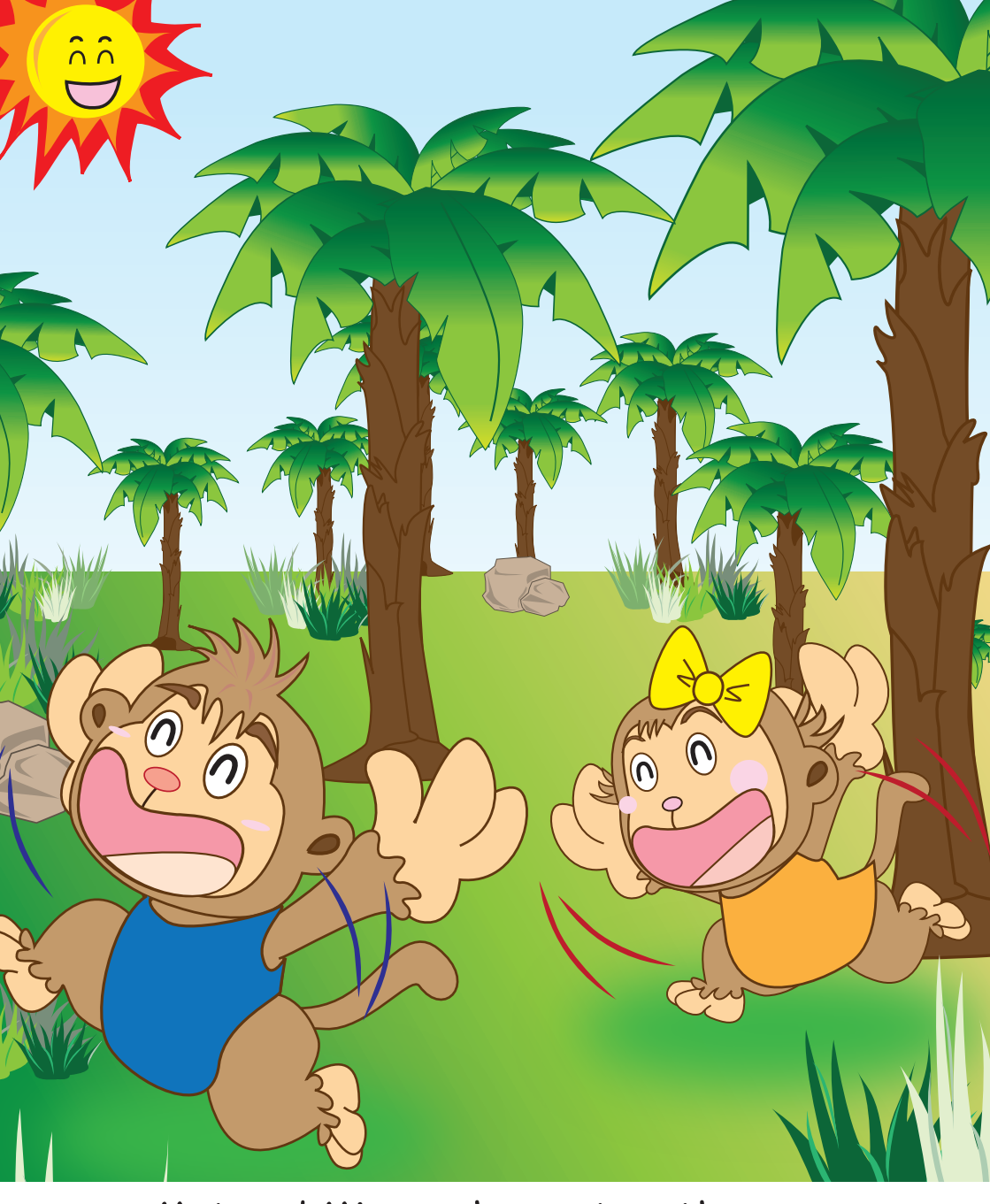
Mat and Mip are happy together.