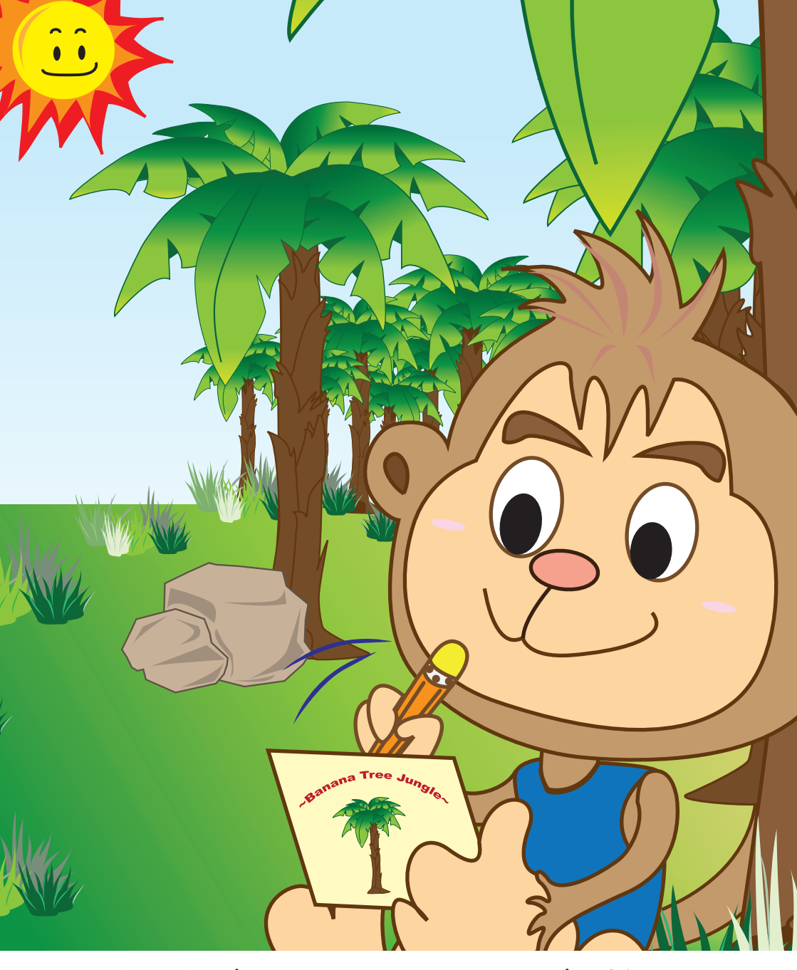
Mat Monkey is sitting in a jungle. He is writing a postcard to Mip Monkey.