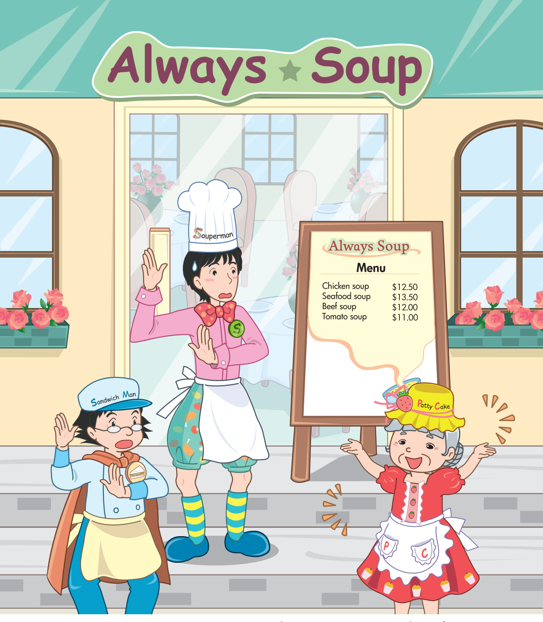
Hi, I'm Patty Cake. I can help.