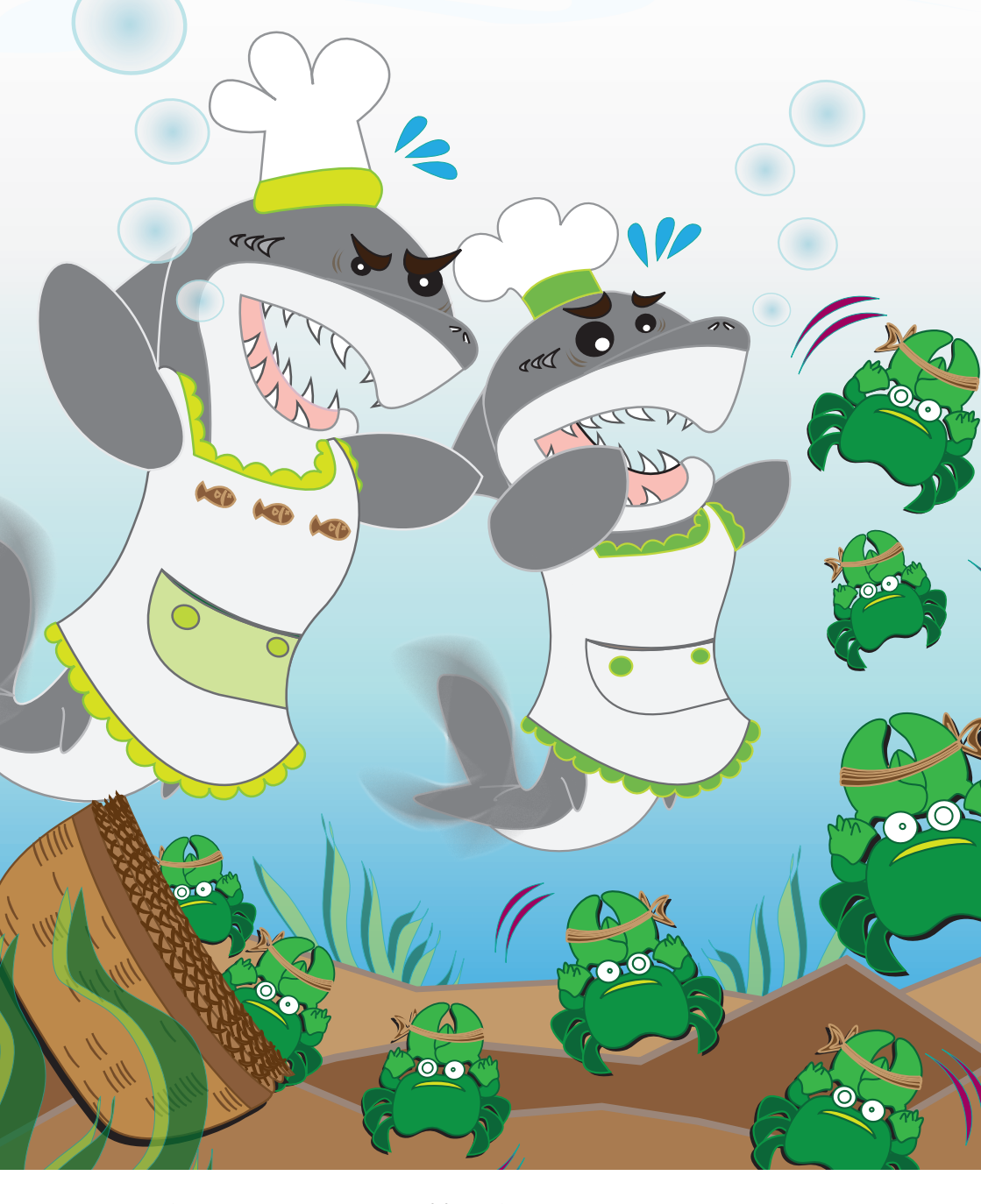
Where are all the crabs going?