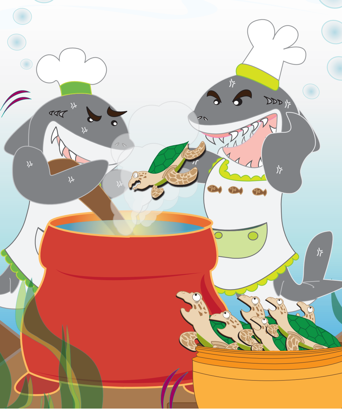
It's time for turtle soup.