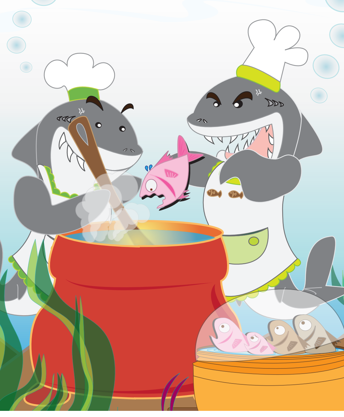
It's time for fish soup.