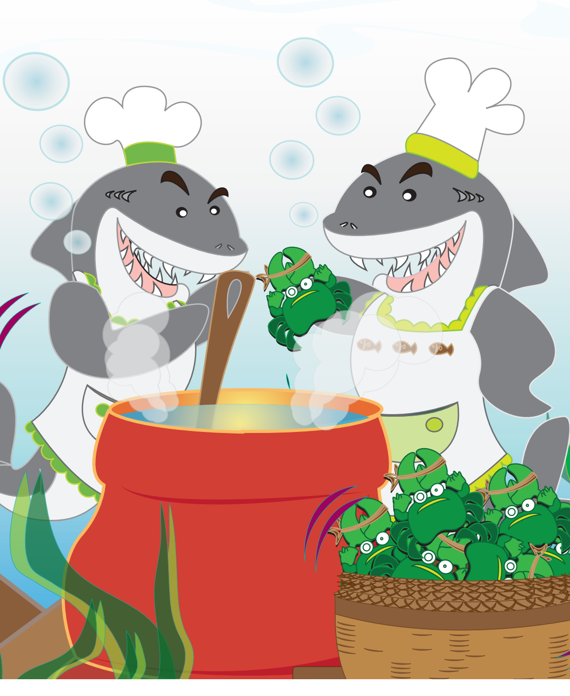
It's time for crab soup.