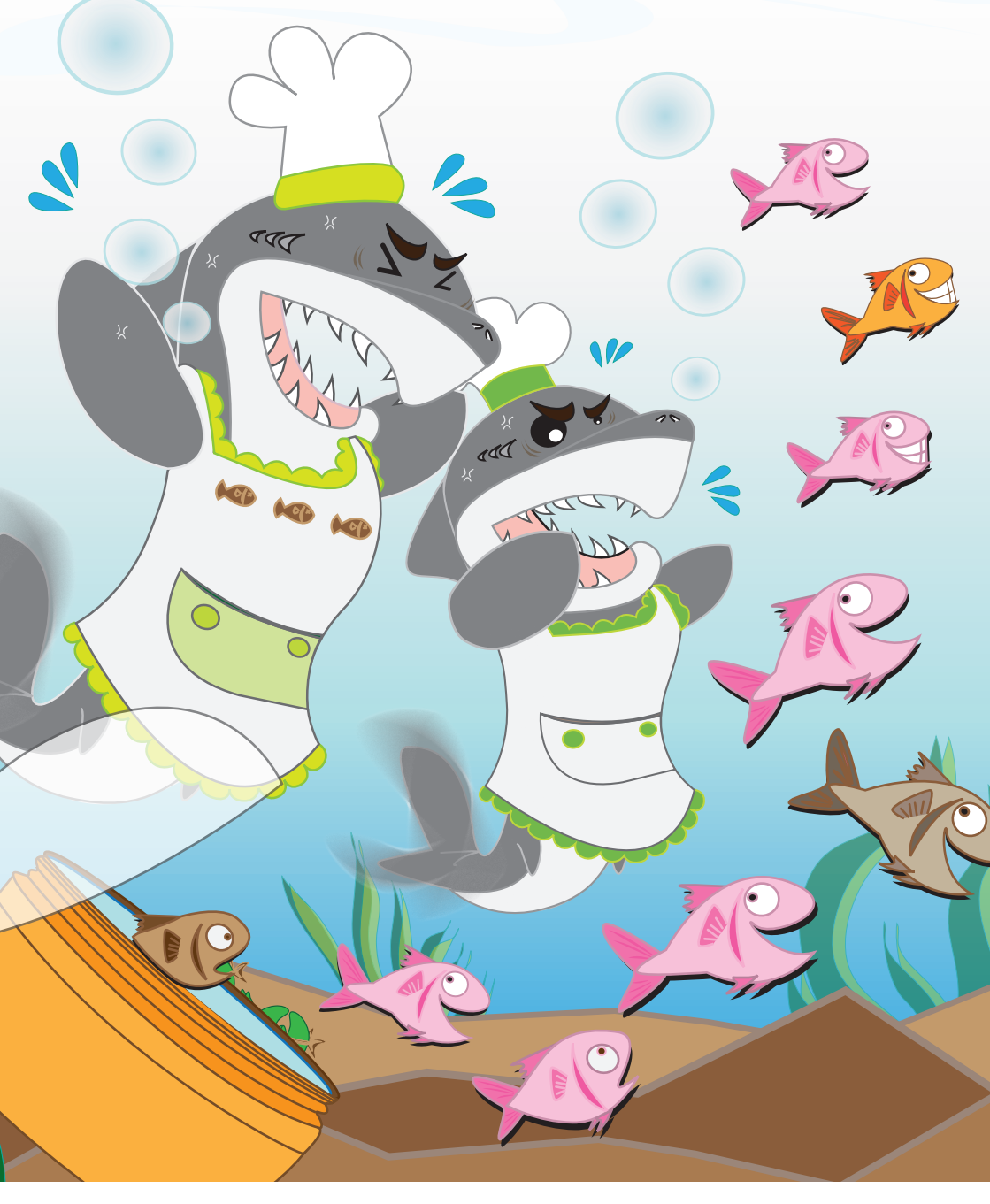
Where are all the fish going?