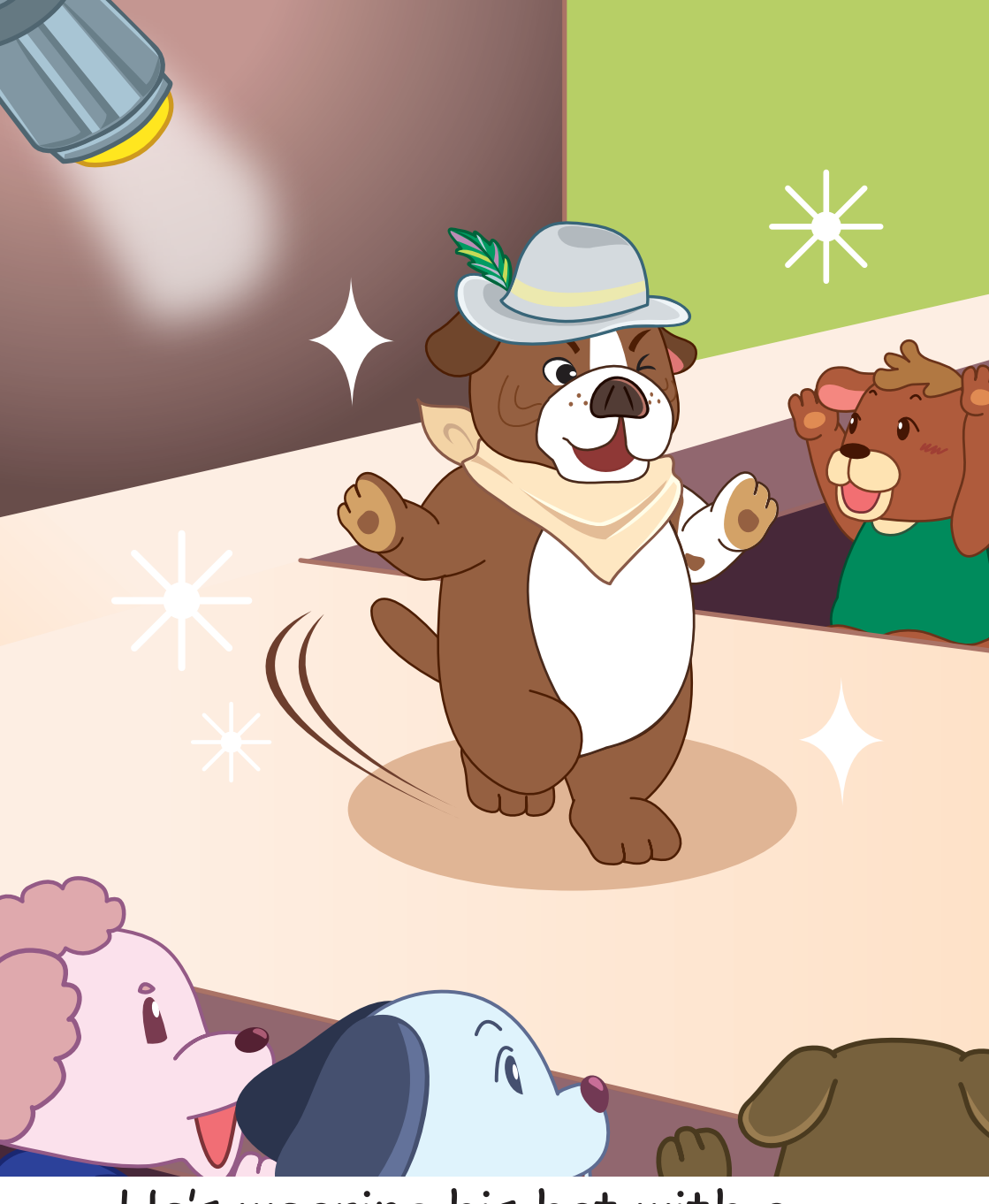
He's wearing his hat with a feather on it.