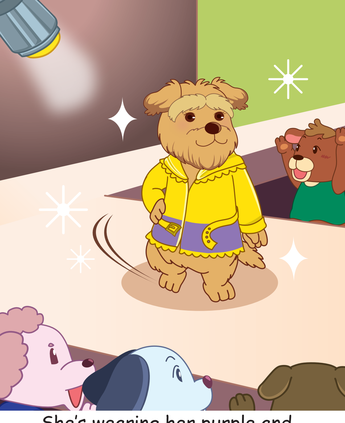
She's wearing her purple and yellow jacket.