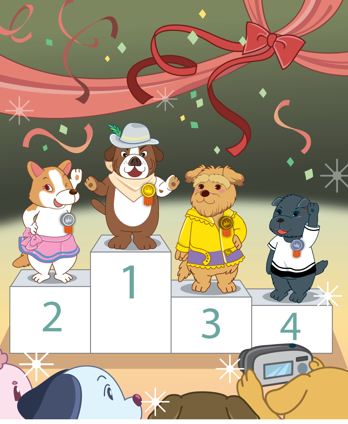
All the dogs are very excited.