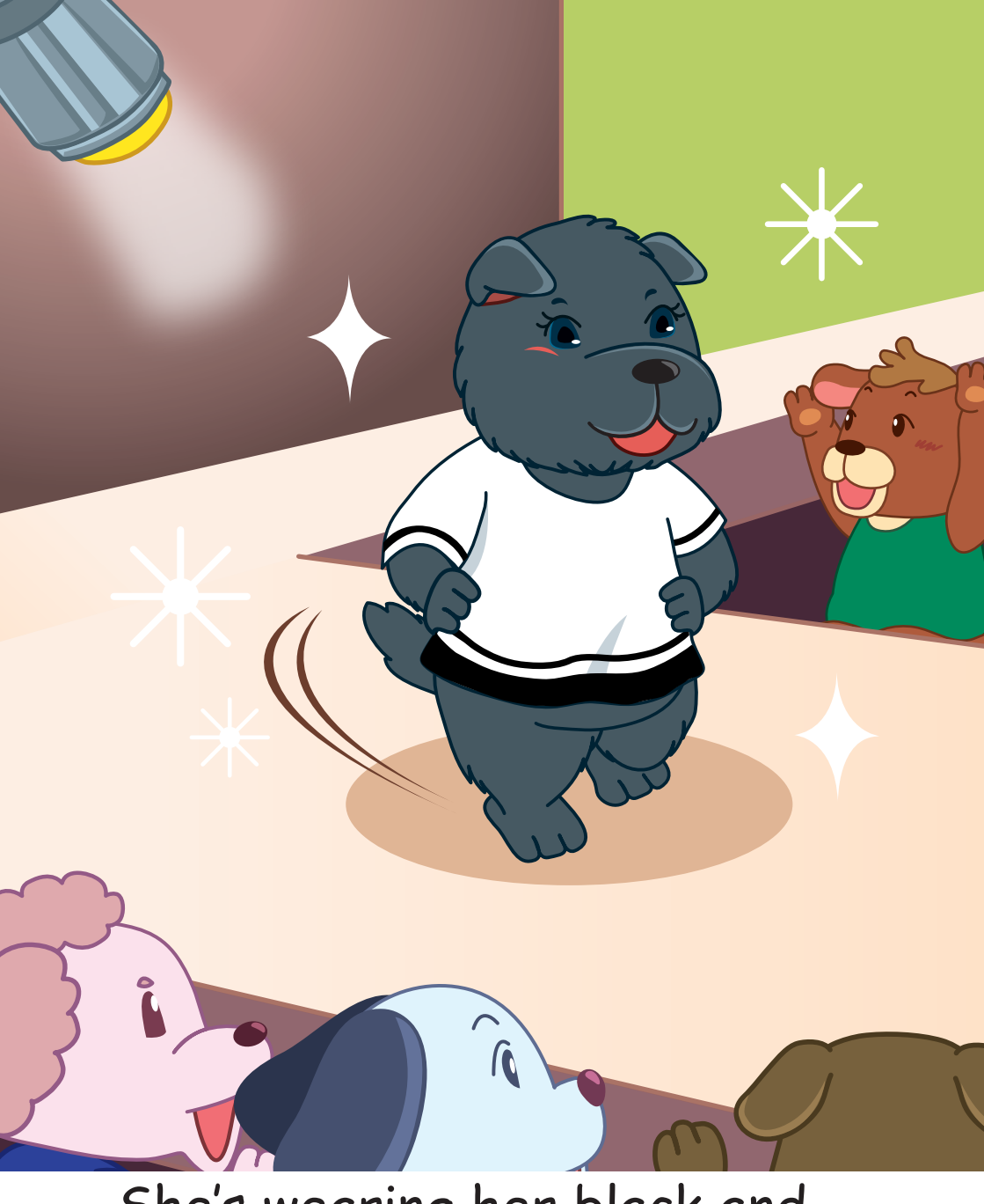
She's wearing her black and white T-shirt.