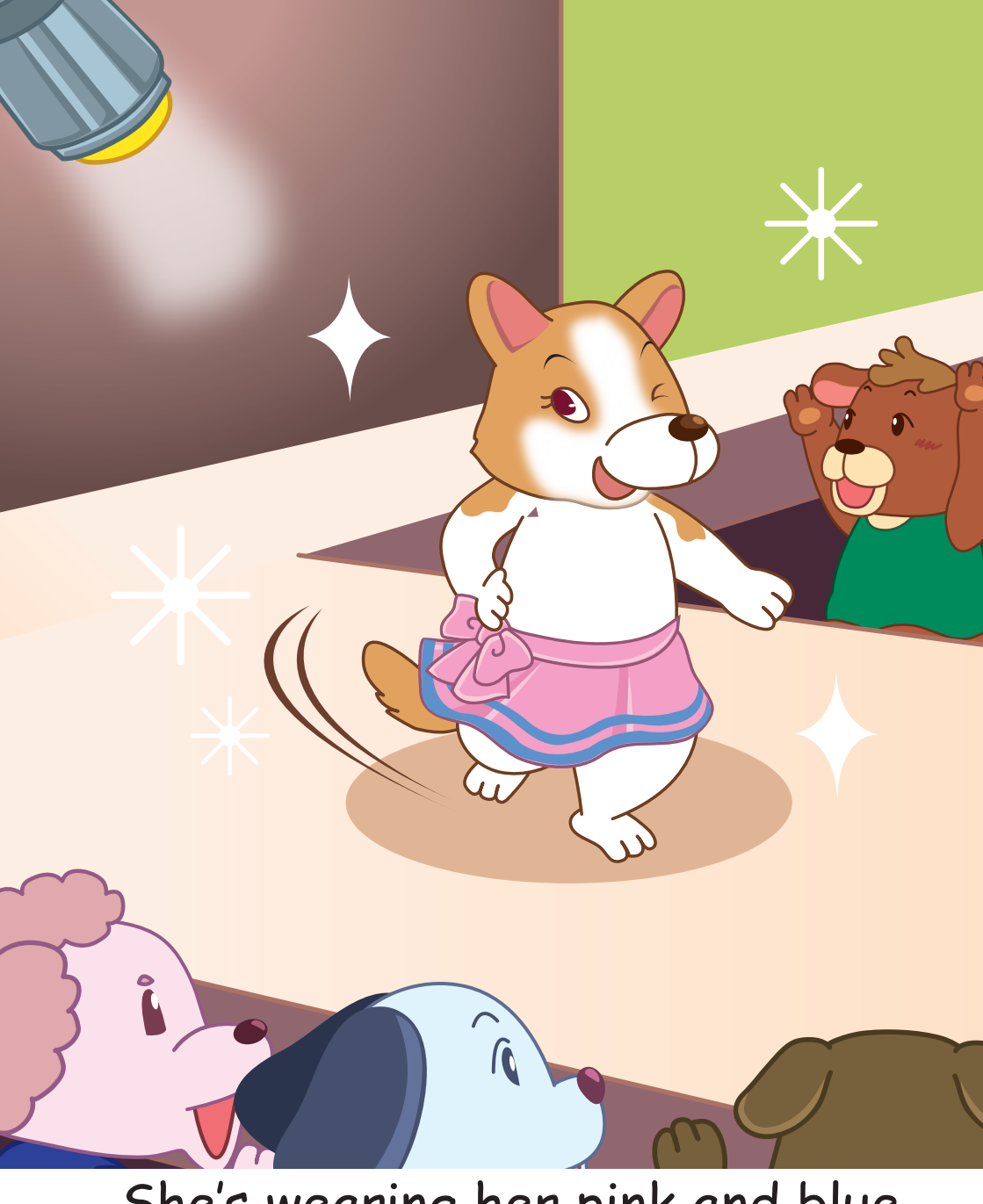
She's wearing her pink and blue skirt.