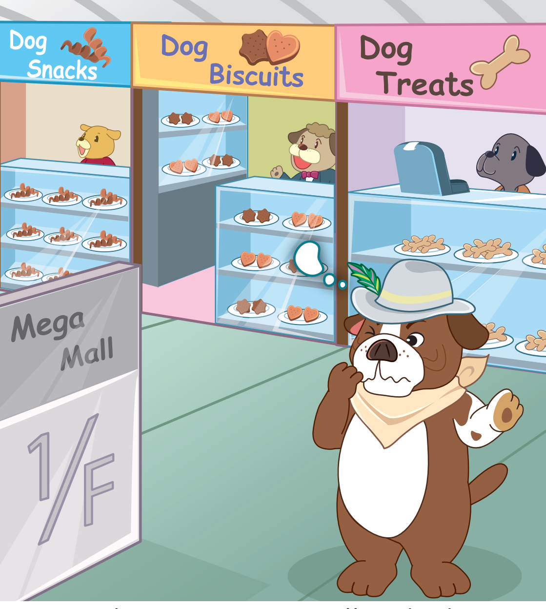
Spike is in Mega Mall. Which food does he like best?