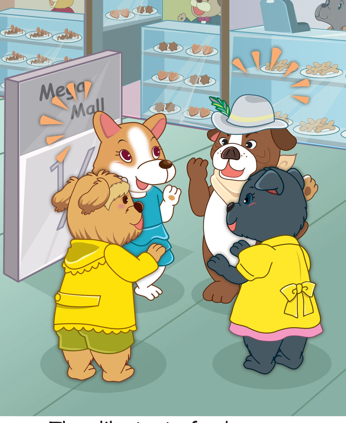
They like tasty food.