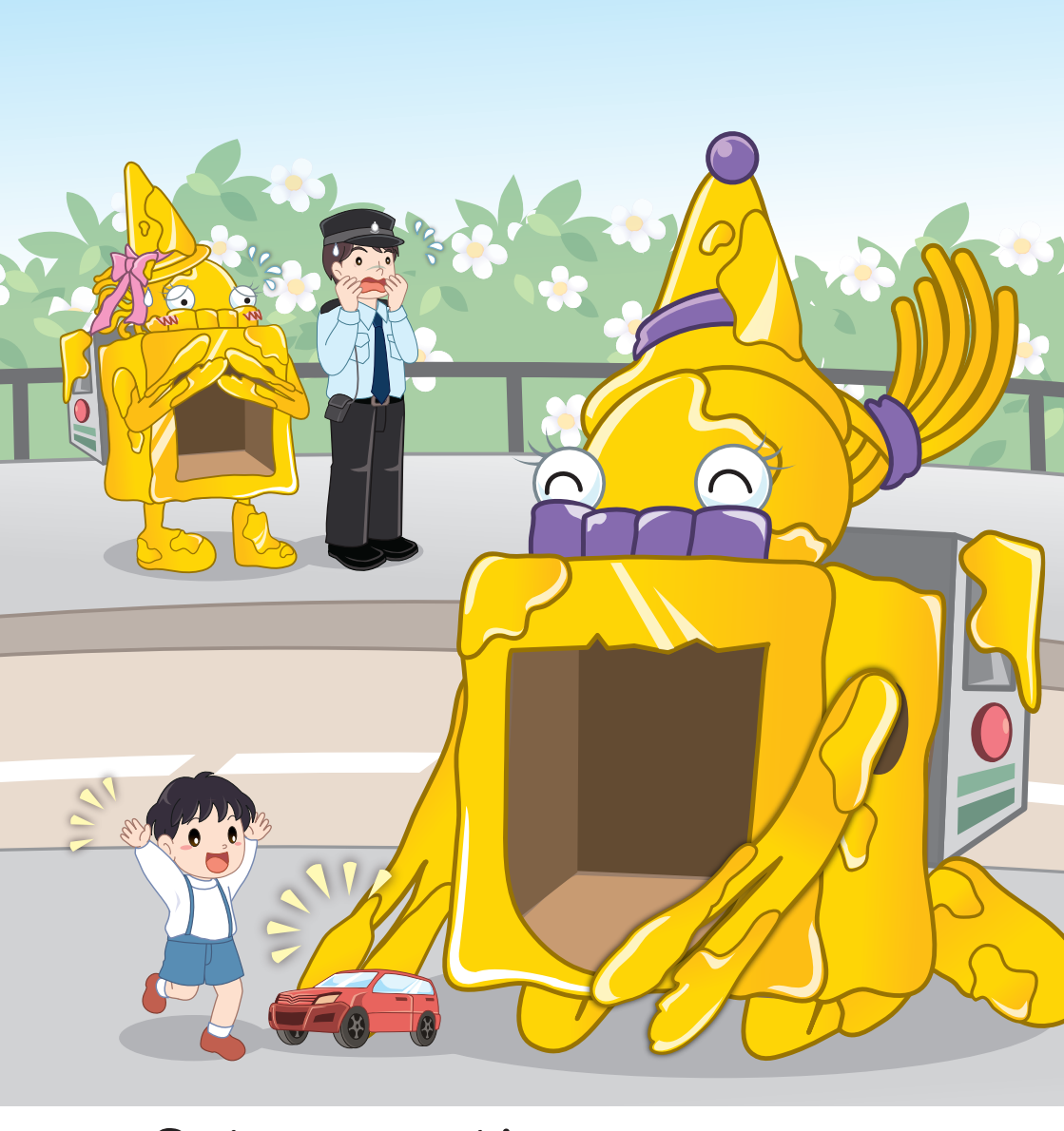
Out came a tiny car.