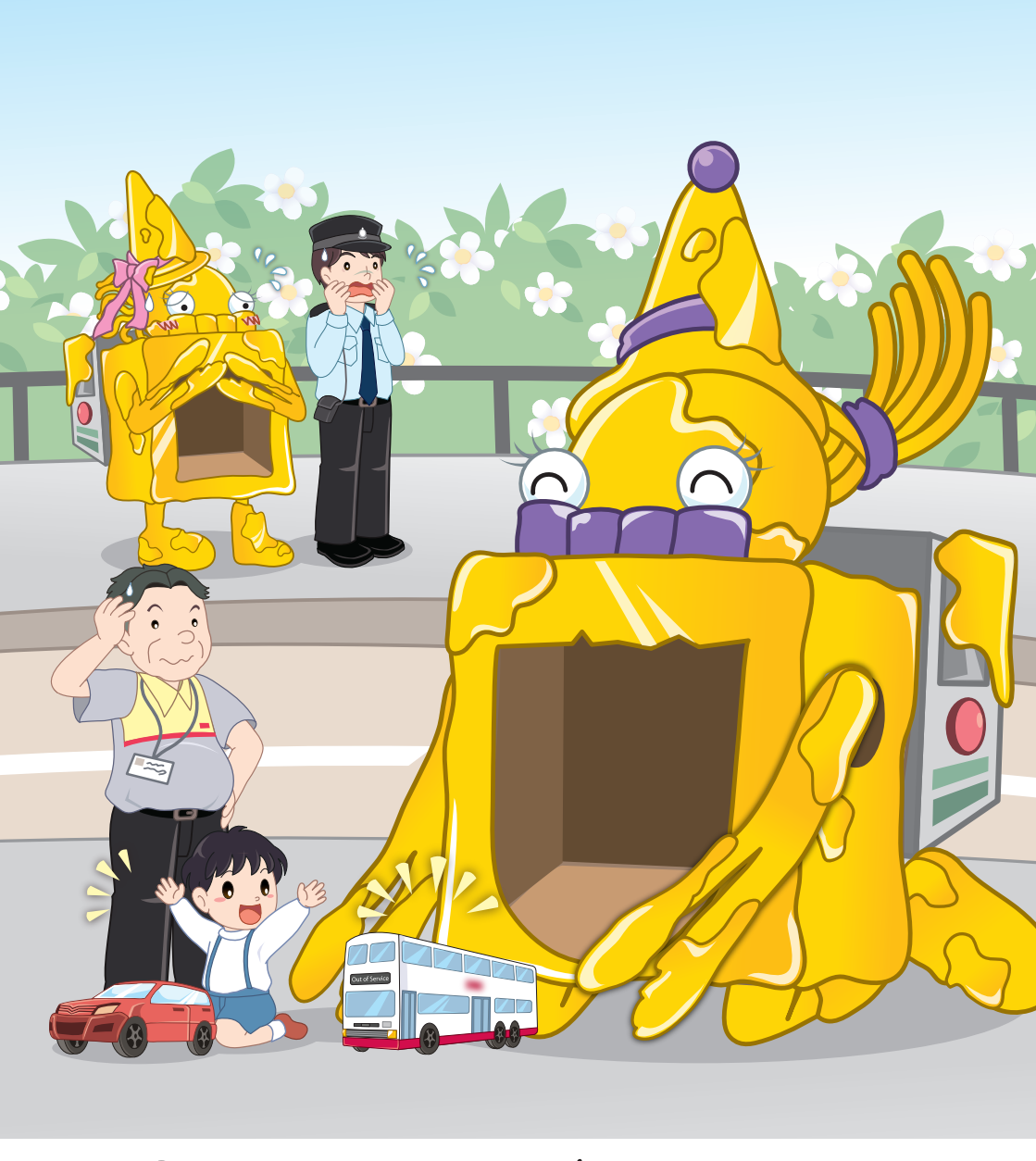
Out came a tiny bus.